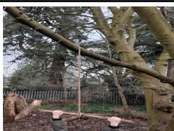
Playing on the swing (Y3)