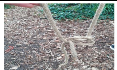
Making swings of their own (Y3)