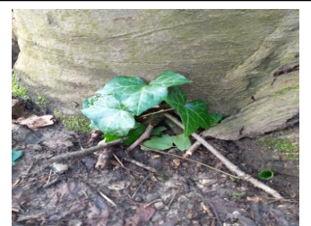
Little homes for little people (Y2)