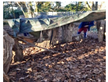
Den Building (Y2)