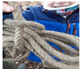
Rope Work (Y2)

The children also enjoyed, collecting fire wood, building a fire and keeping the fire going by carefully adding wood to it. They also consumed food that had been cooked on the fire.