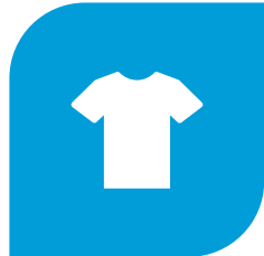
WESTFIELD PE SHIRT